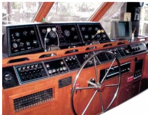
Command Bridge - Lower Helm