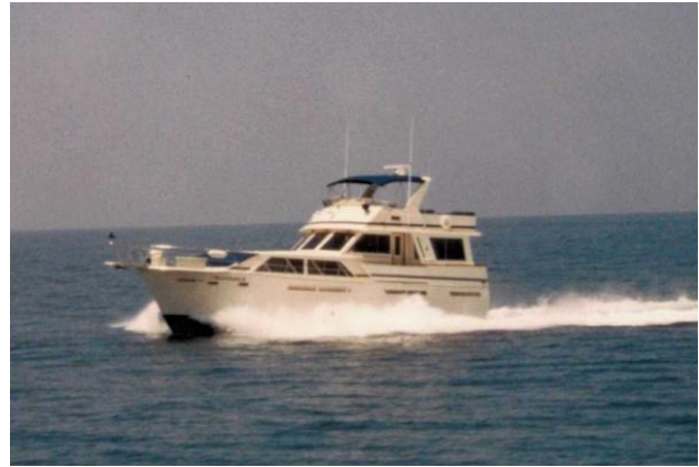
Miss Dottie II - 20 knot cruise