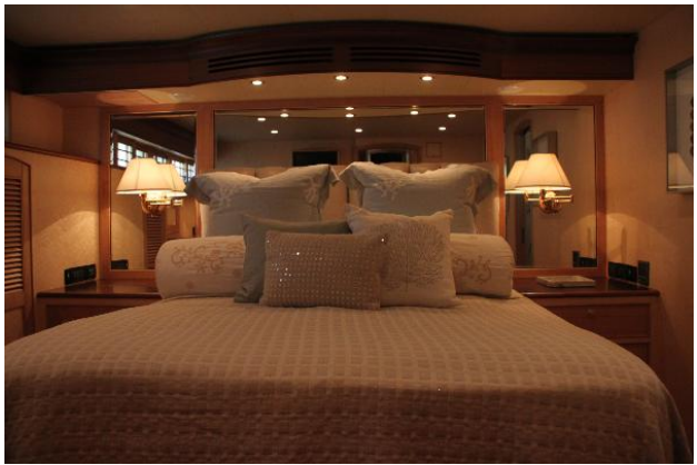
Master Stateroom - Queen Bed