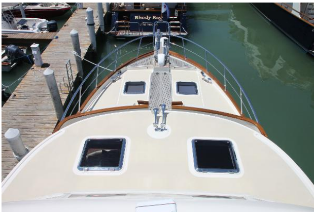
On Top Of Hard Top Looking Down