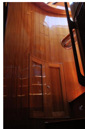
Pilot House to Companionway Stairs