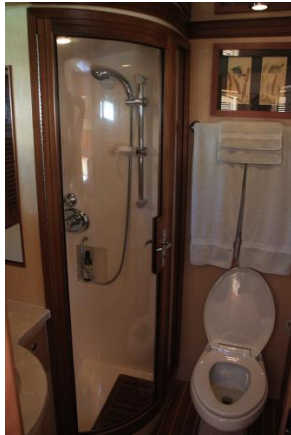
VIP Head Looking Aft