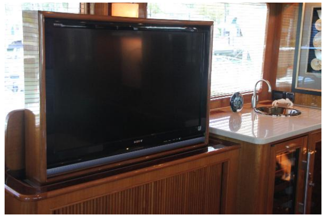
Salon TV & Bar on Port Side