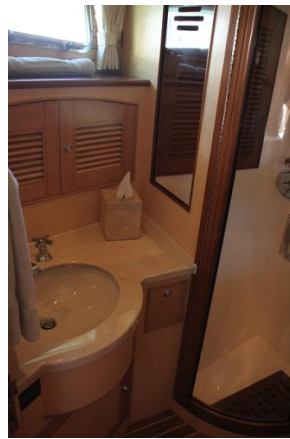
VIP Head Looking Starboard