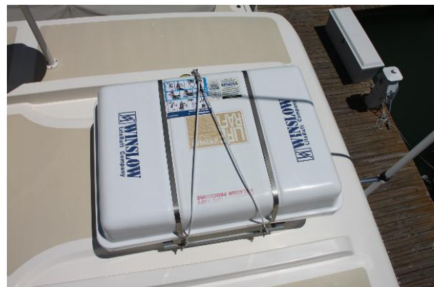
6 Person Life Raft