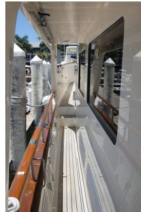
Port Side Deck Looking Forward