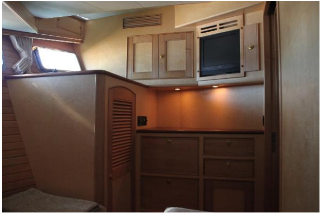
Port Guest Stateroom Looking Forward