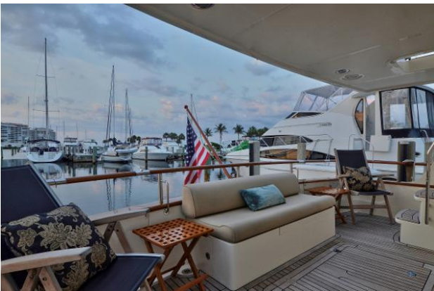
Aft Deck Arrangement 2