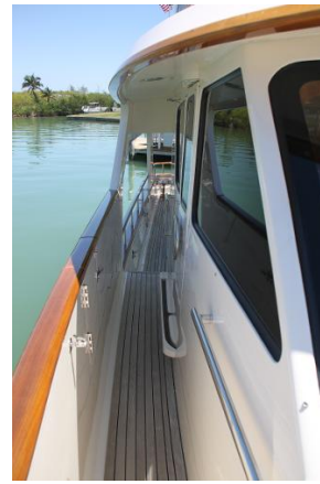
Starboard Side Deck Looking Aft