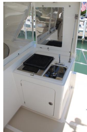
Grill & Sink