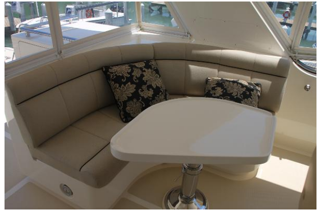
Flybridge Port Seating