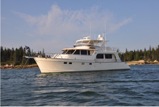
Anchored in Maine