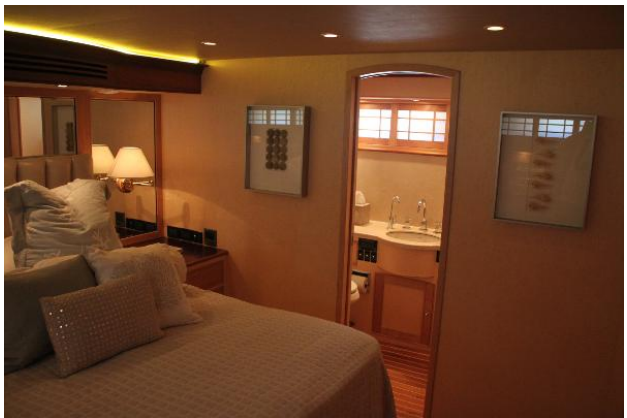
Master Stateroom Looking to Port Head