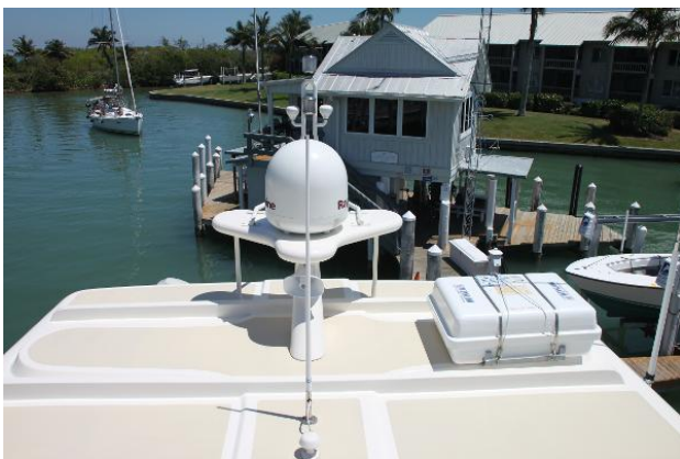
Looking Aft From Hard Top