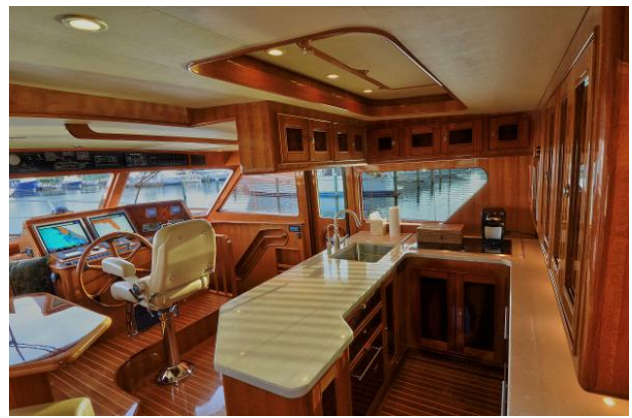
Galley Looking Starboard