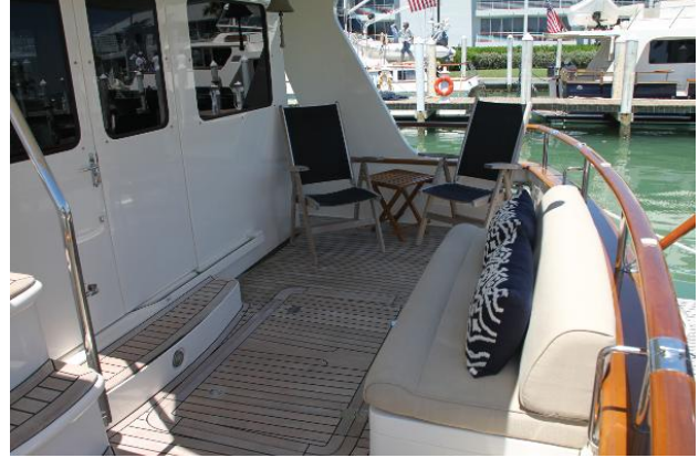
Aft Deck Arrangement