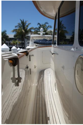
Port Forward Boarding Gate