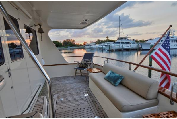
Sunset in Florida