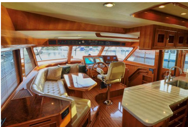
Galley/ Pilot House Looking Forward