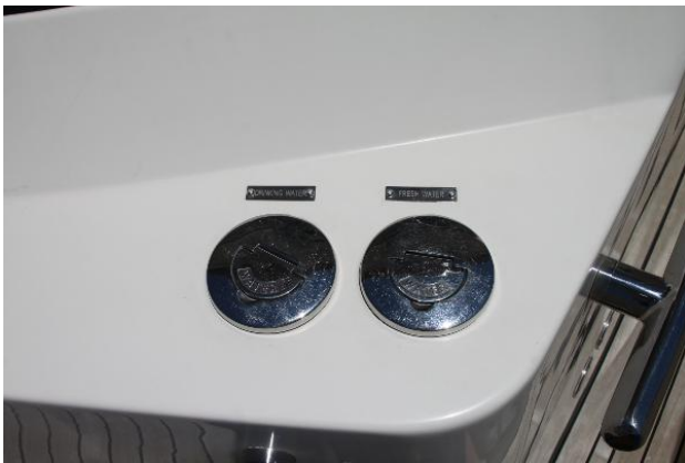
Fresh Water & Drinking Water Fills (Port Side)