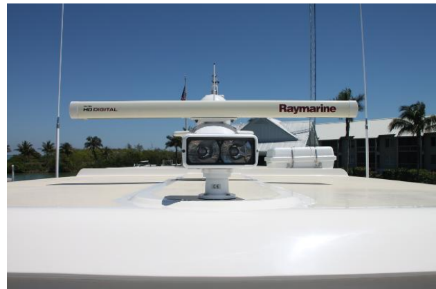
Looking Aft From Front Edge of Hard Top