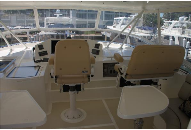
Flybridge Looking Forward