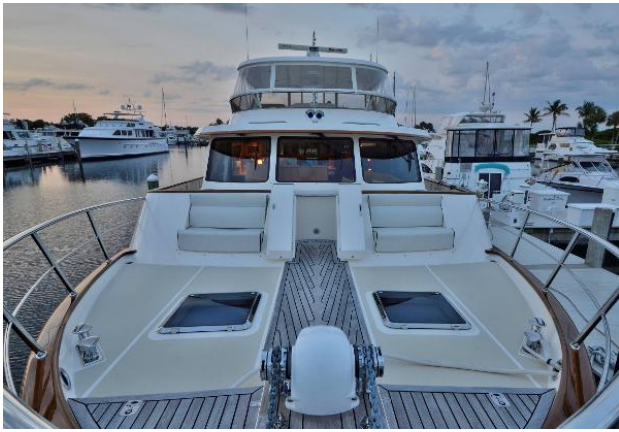
Bow Seating Looking Aft