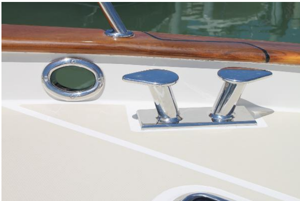
Starboard Forward "oversized" Cleat & Hawes Pipe