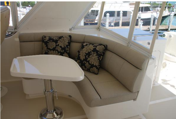
Flybridge Starboard Seating