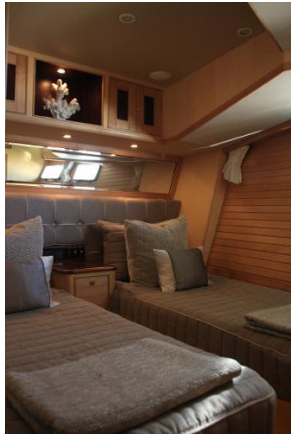
Port Guest Stateroom Looking After/ Port