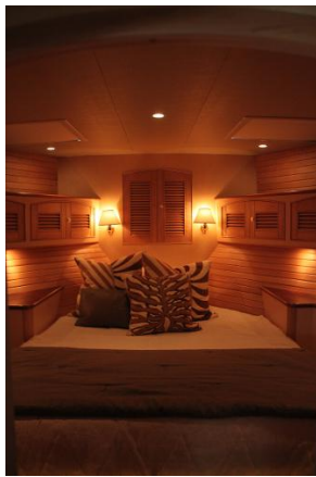
VIP Queen Bunk Looking forward