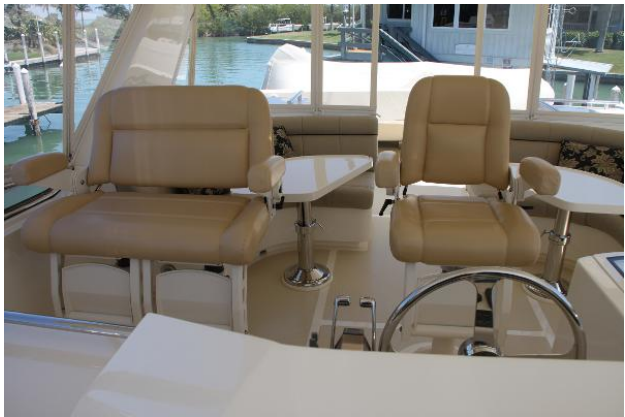
Flybridge Looking Aft