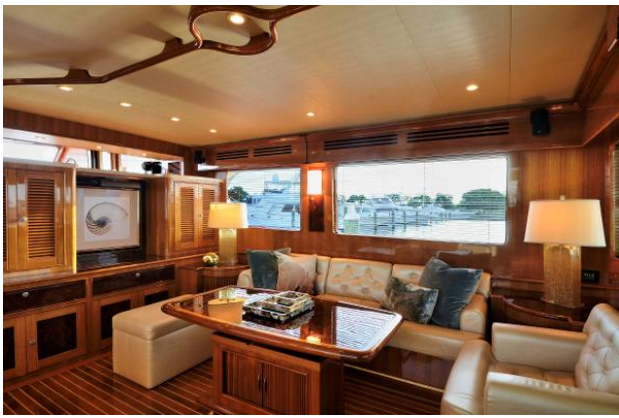
Salon Looking Starboard