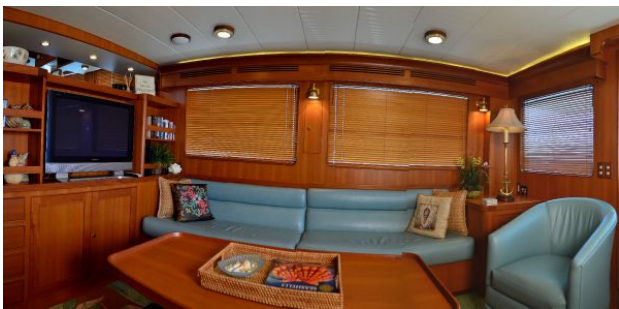
Salon stbd side