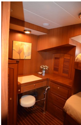
Guest Stateroom - Desk