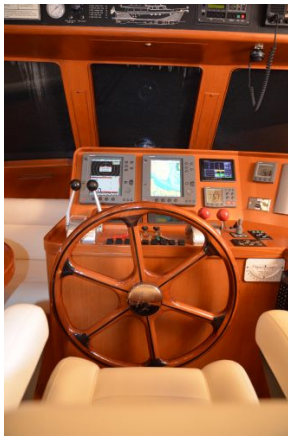
Pilotouse Helm Station