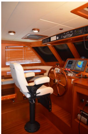
Lower Helm Chair