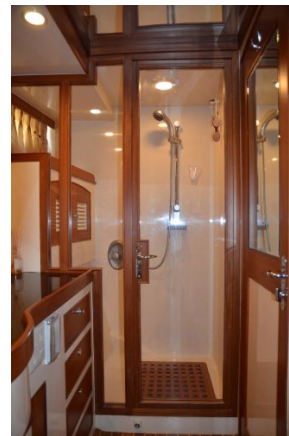
Master Head - Shower