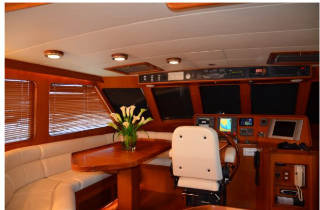
Pilothouse & Seating