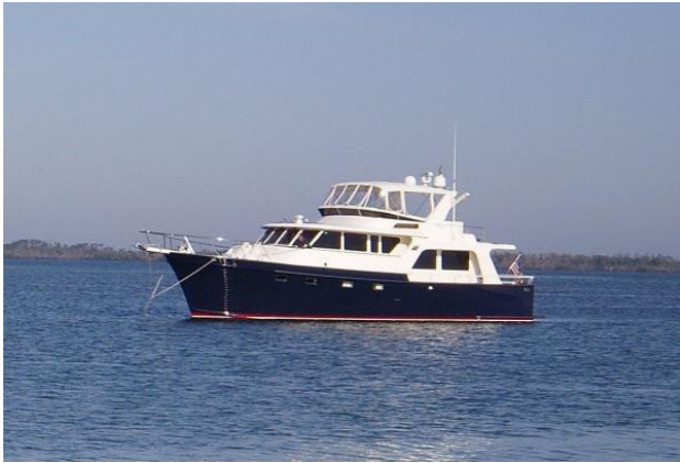
Beech to Beach