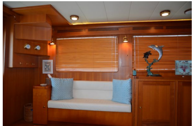
Salon port side