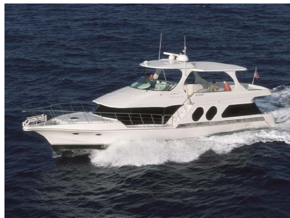
Bluewater 5900 Platinum Series