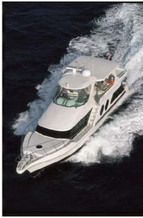
Running - Mfg. Photo