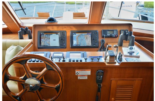
Lower Helm 1