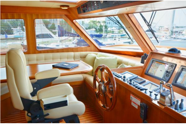
Lower helm 2