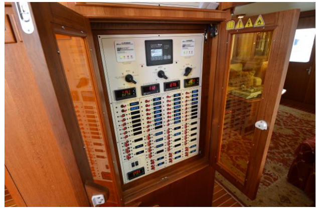
Electrical 110v 220v