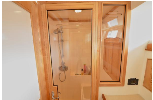
Port guest shower