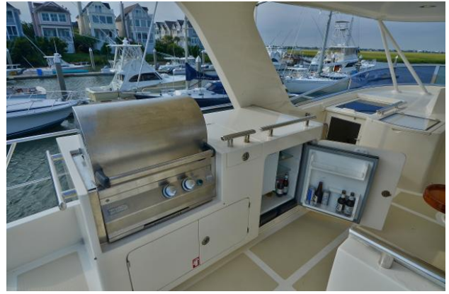
Fly Bridge 2