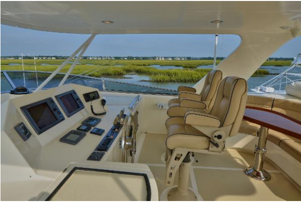
Fly Bridge 1