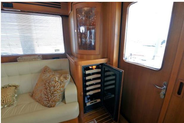
Salon wine cooler