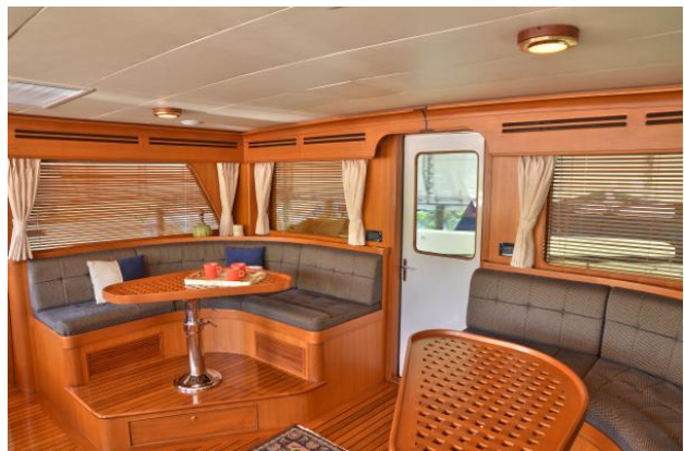
Command Bridge Aft