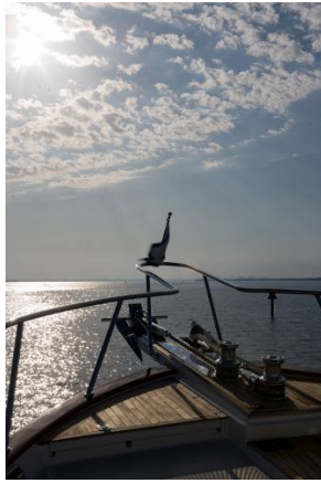
View from Bow