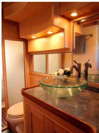
Master Head Port