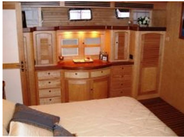
Master to Port