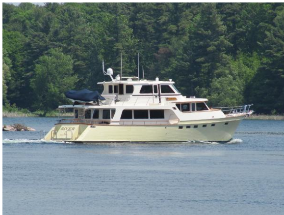
Starboard Quarter View