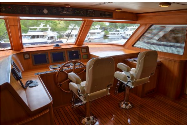
Command Bridge Forward