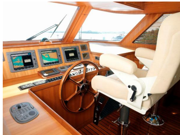
Command Bridge Helm