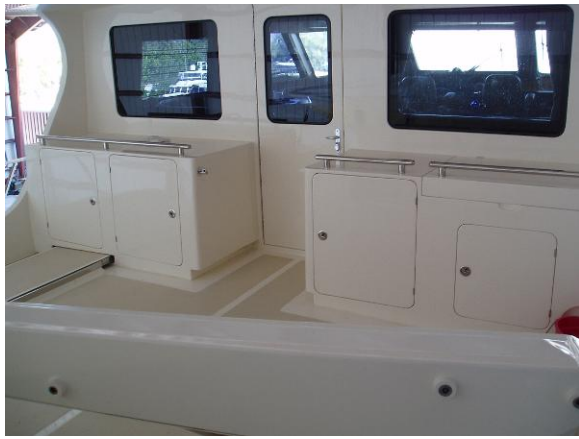
Aft View of Command Bridge