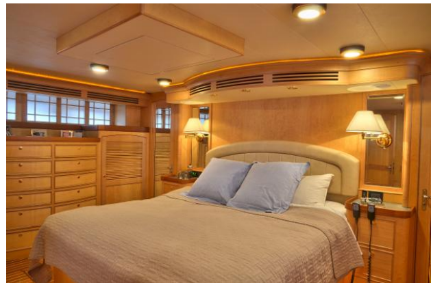
Master Stateroom 3