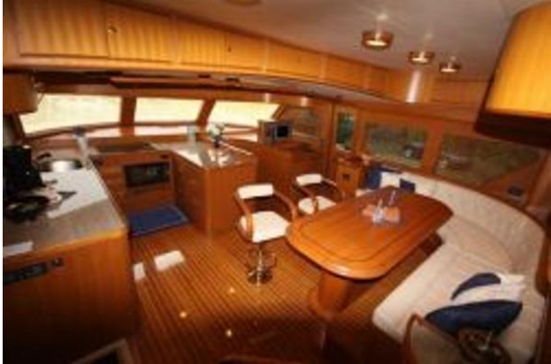
Galley and Dining Area