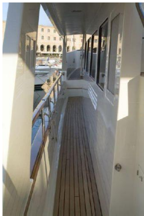
Side deck - port