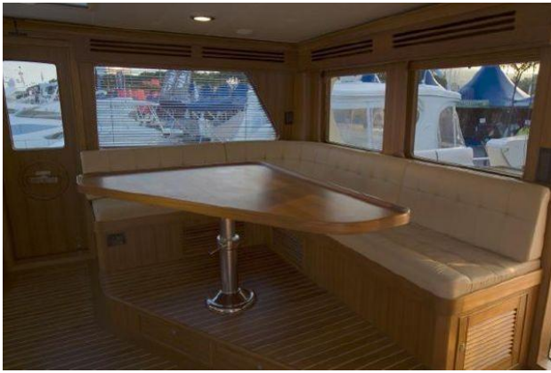
Command Bridge L Settee & Table