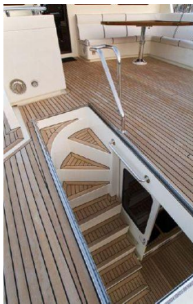
Stairwell to Aft Deck