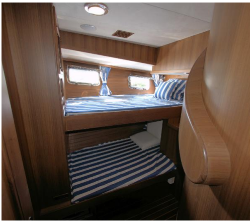
Stbd Bunk Room