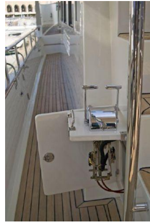
Aft control station