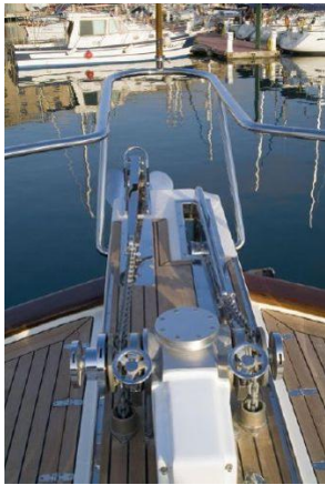
Dual windlasses at bow