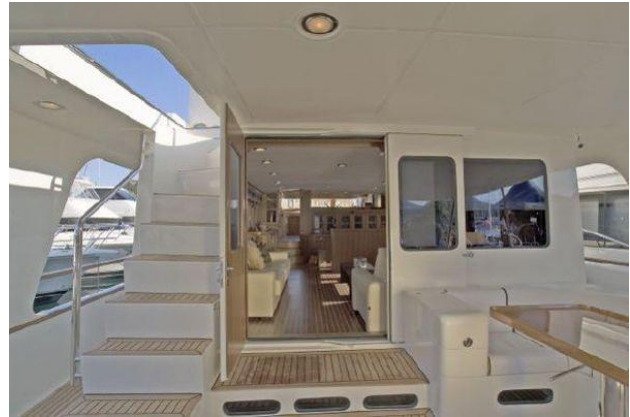
Aft Deck looking into Salon