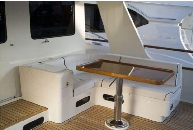
Aft Deck L Settee