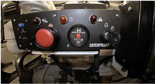
Engine Hours Stbd