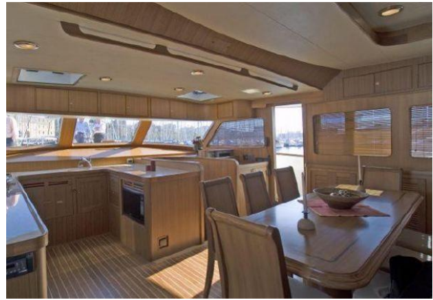
Galley and Dining