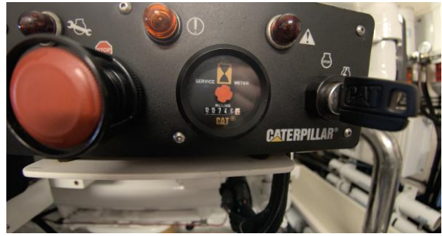
Engine Hours Port