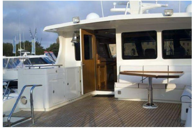
Command Bridge Aft Deck