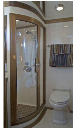
Guest Head and Shower