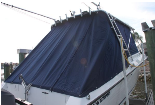
New Canvas 2012 - Full cover keeps her very clean