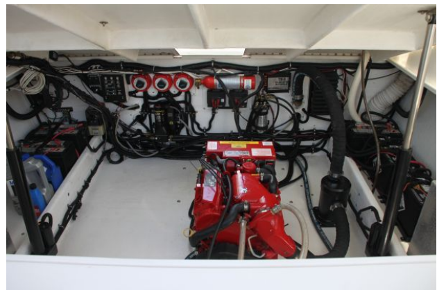
Center Storage Area