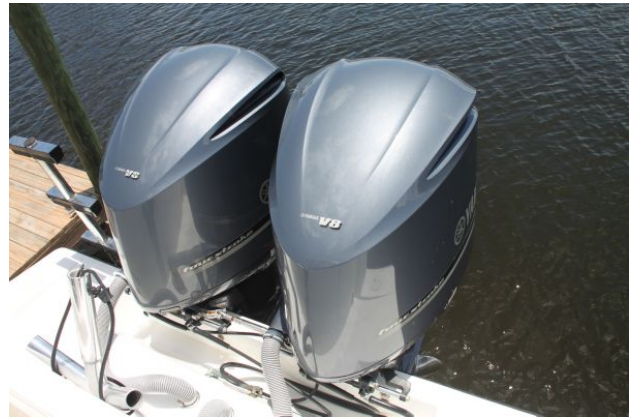
Twin Yamaha 350's - 199 hours