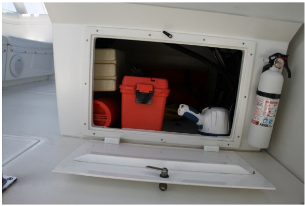
Under Helm Storage