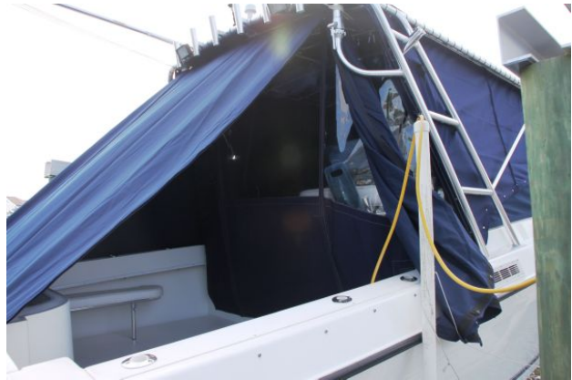
Handy Aft 4 Side Enclosure