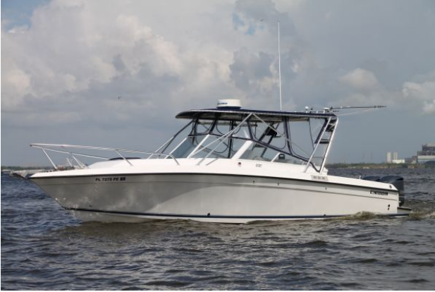
Contender 35 Express