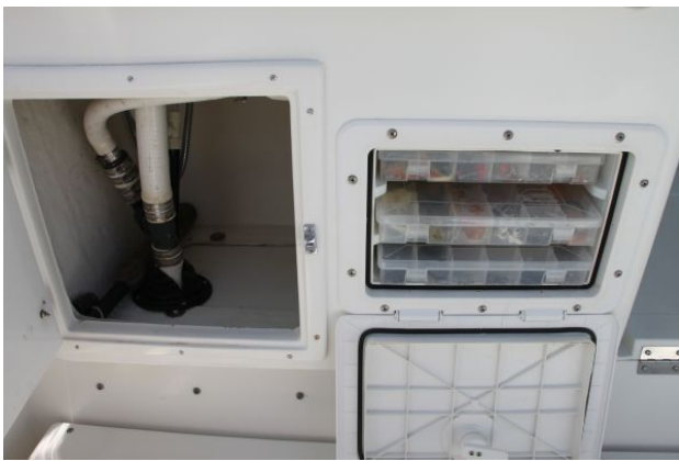
Tackle Box & Storage Under Rigging Station