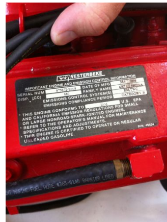
Westerbeke Gen Set