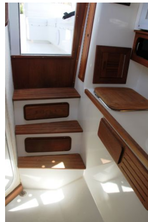
Stairs to Deck