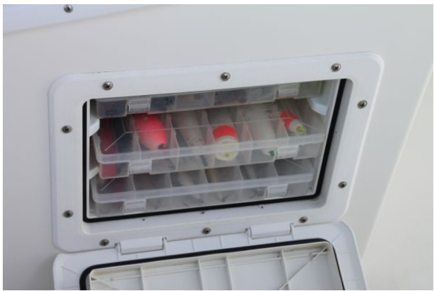
2nd Tackle Box