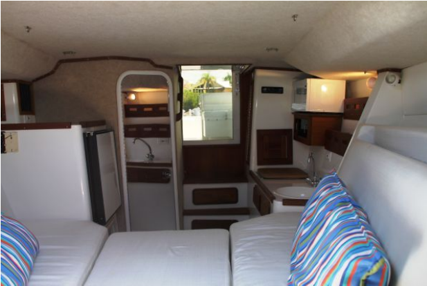
Cabin Looking Aft