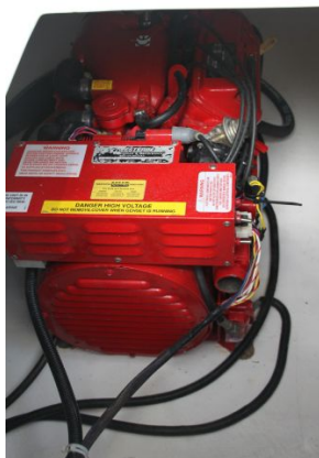
Westerbeke 5.0 BCG Generator - 20 hours