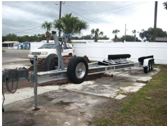
Load Master Trailer