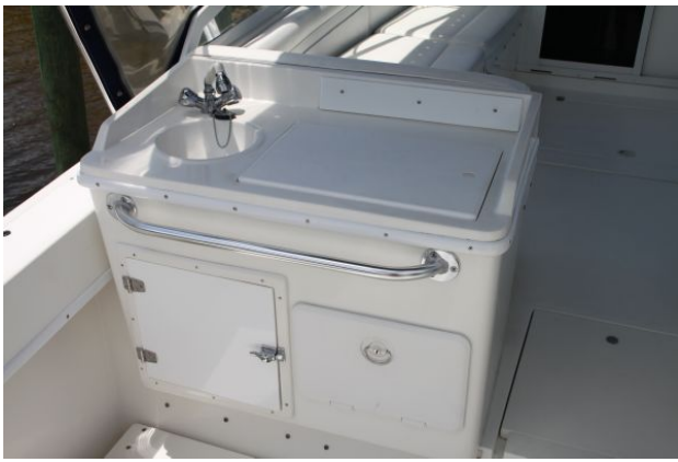
Rigging Station & Sink