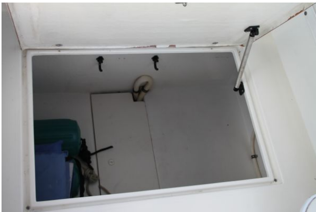
Mid Ship Storage