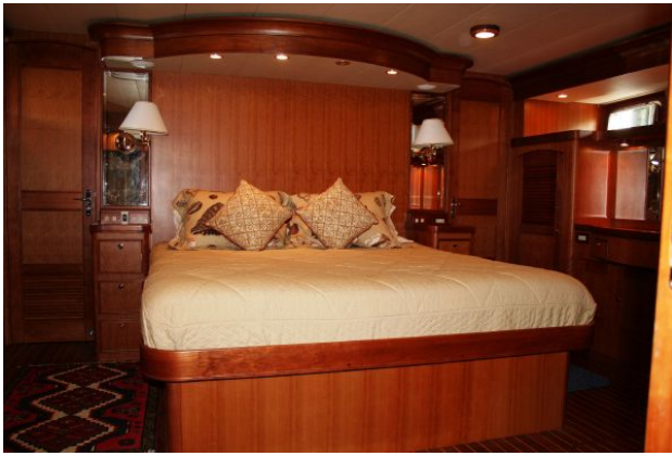
Full Beam Master Stateroom