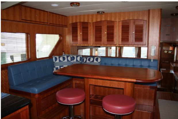
Galley Dinette & Setee