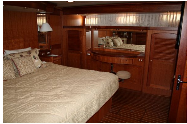
Master Stateroom Vanity