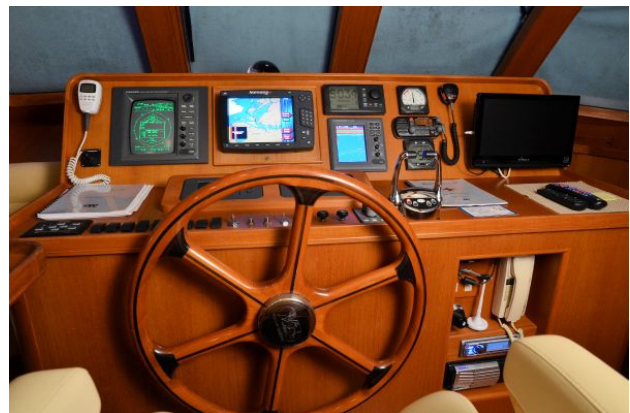
Pilothouse Helm Station