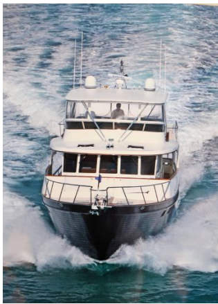
Bow Running View