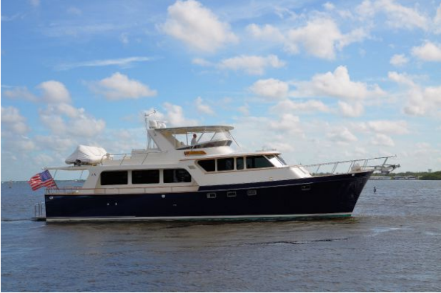
Reel Class II