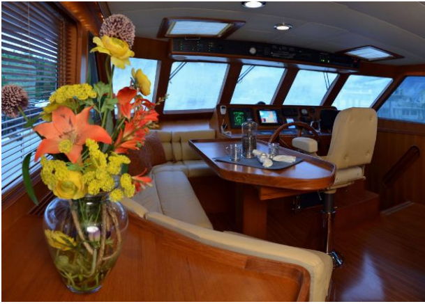
Pilothouse & Seating