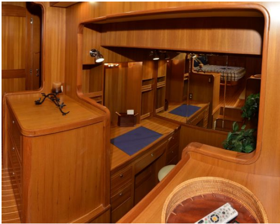
Master Stateroom Office Area