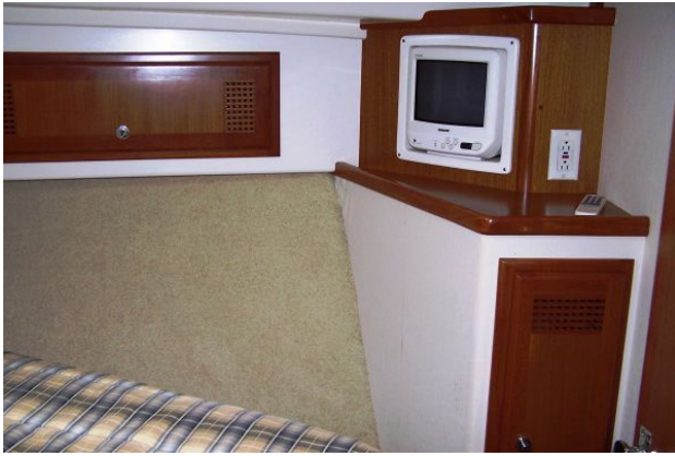
Master Stateroom Entertainment