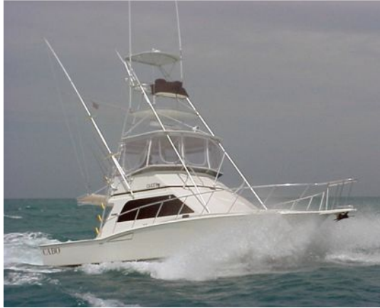
35 Cabo Running