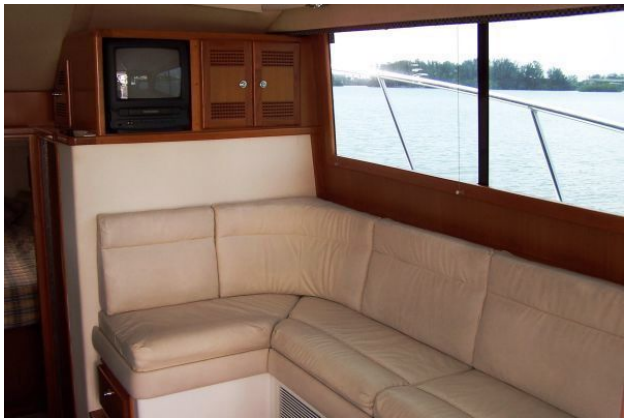
Salon Entertainment & Seating