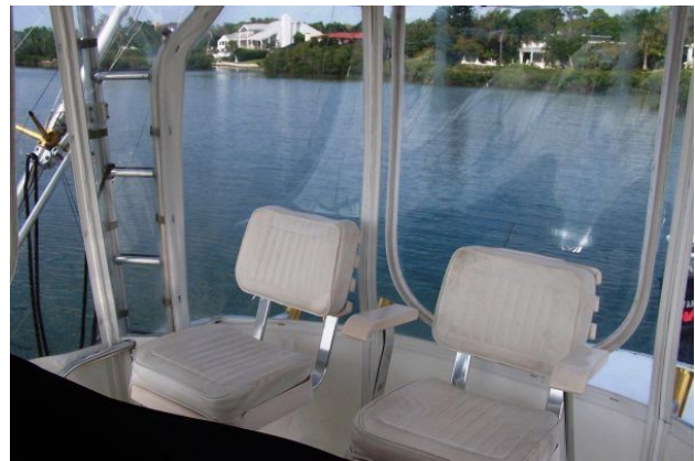
Flybridge Helm Seating