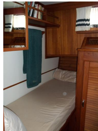
Guest port berth