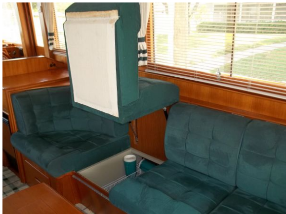
Under Settee Storage