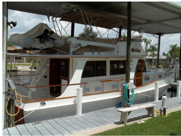
Docked under cover