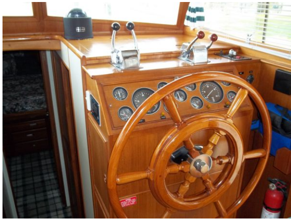
Lower Helm Station