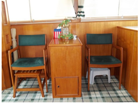
Salon to Port