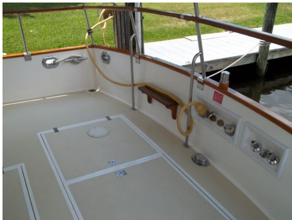
Cockpit looking to starboard