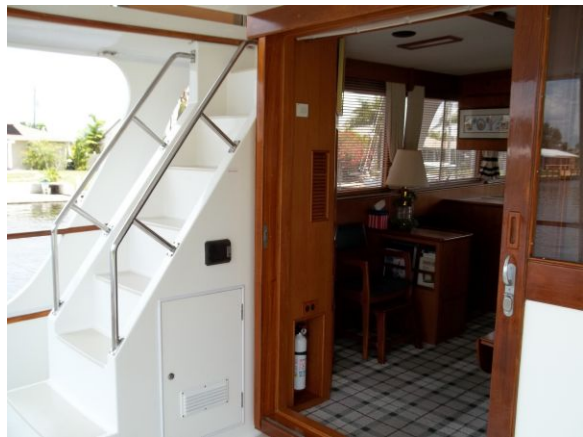
Stairs to Flybridge