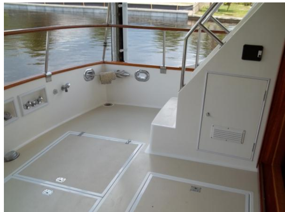
Cockpit looking to port