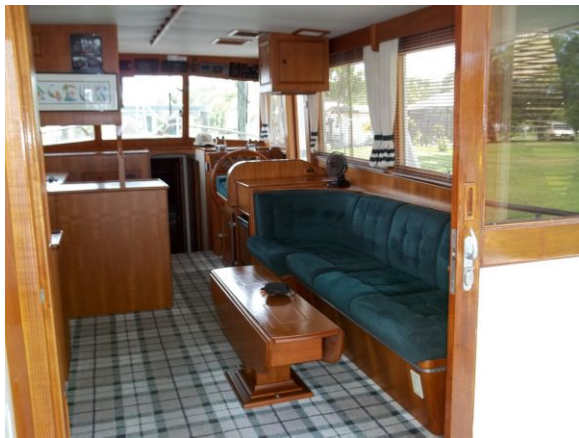
Salon to Starboard