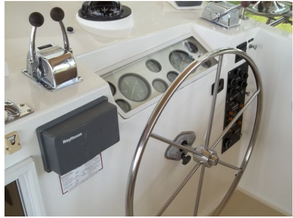
Upper Helm Station