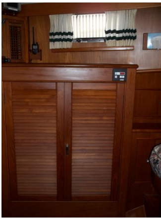
Frwd Stateroom Cabinetry