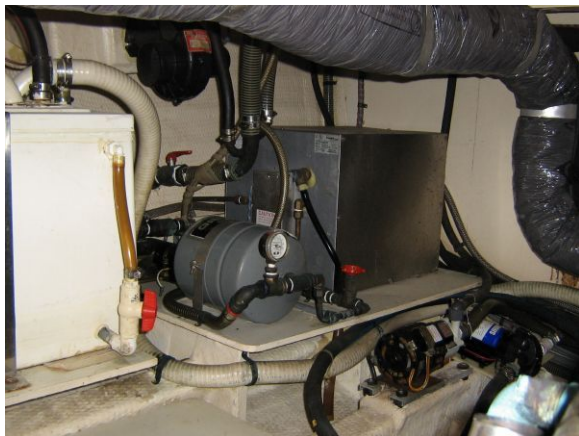
Fresh Water System