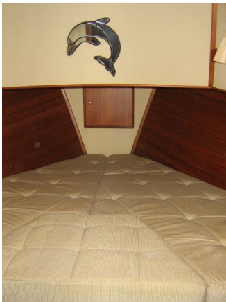
V-Berth w/ Filler