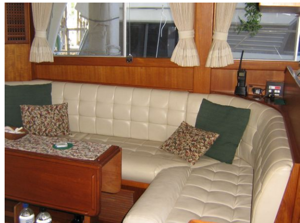
Salon Looking Port