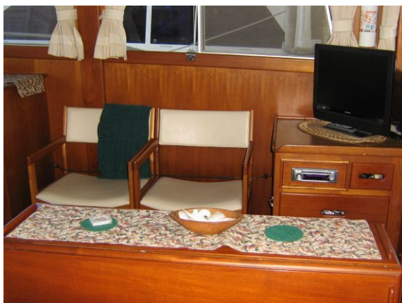
Salon Looking Starboard