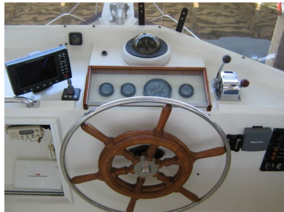
Upper Helm Station