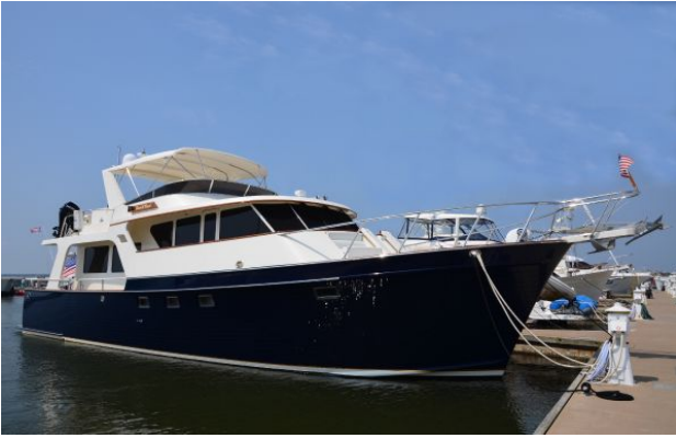
Beech To Beach