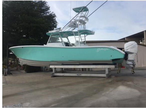
On Land Profile