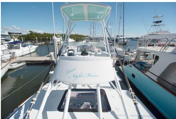
Upper Helm Roof