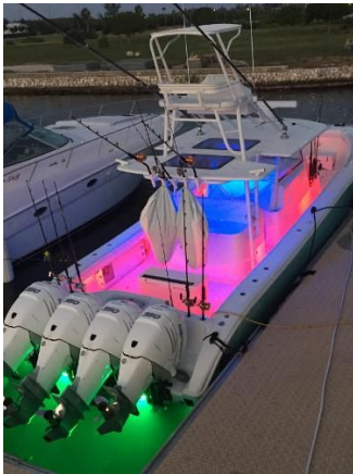
Deck and Underwater Lights