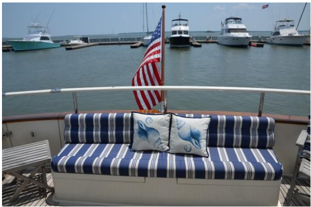
Large Aft Seat