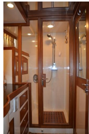
Master Head - Shower