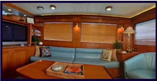
Salon Starboard side