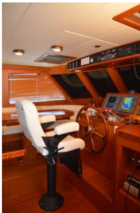
Lower Helm Chair