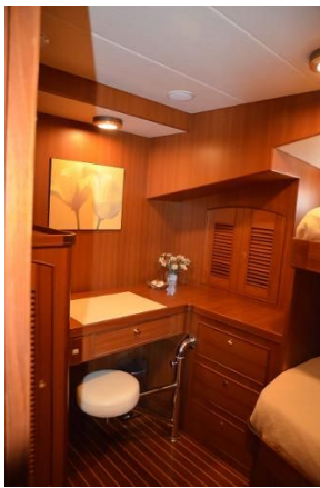
Guest Stateroom - Desk