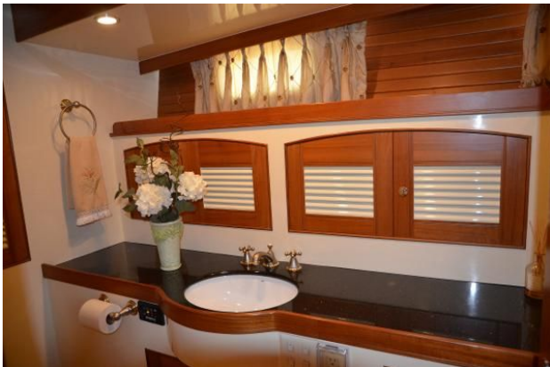
Master Head - Sink