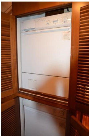
Washer / Dryer