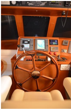
Pilotouse Helm Station