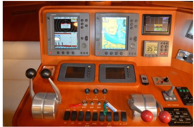
Pilotouse Helm Station