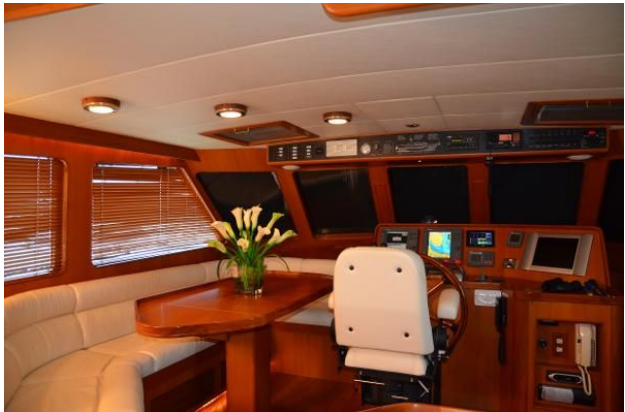
Pilothouse & Seating