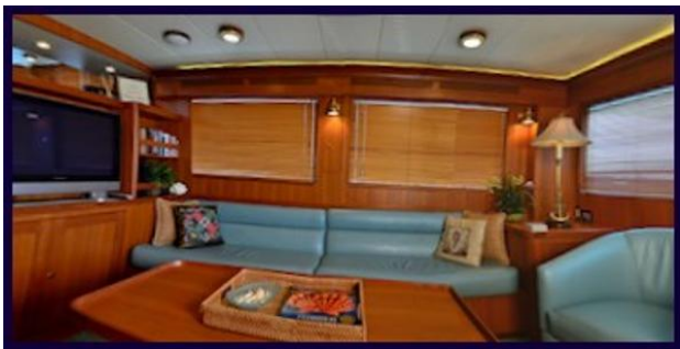
Salon Starboard side