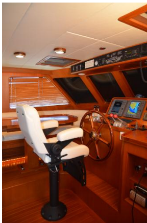
Lower Helm Chair