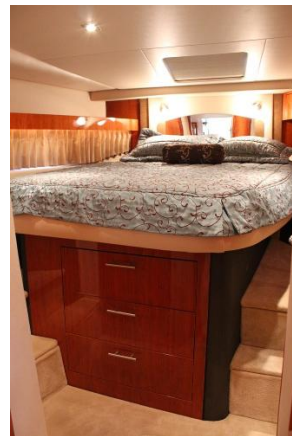
Master Stateroom Forward