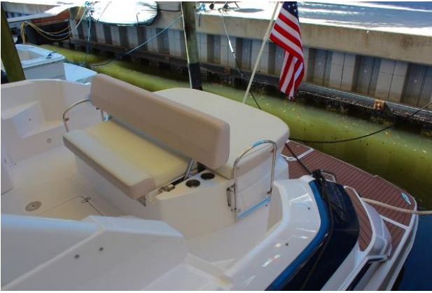
Cockpit Seating & Sunpad