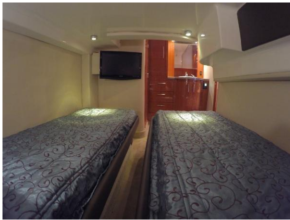
Guest Stateroom Port