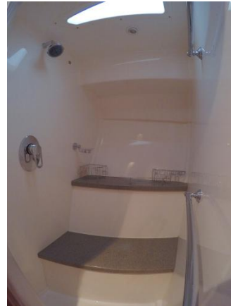
Master Stateroom Shower