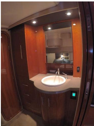
Guest Stateroom Sink