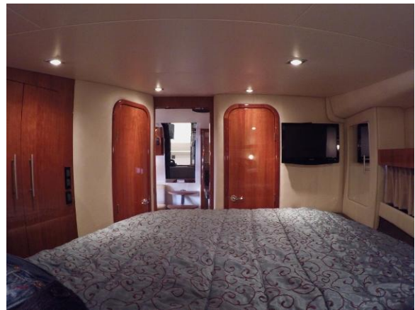
Master Stateroom Aft