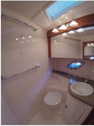
Master Stateroom Head