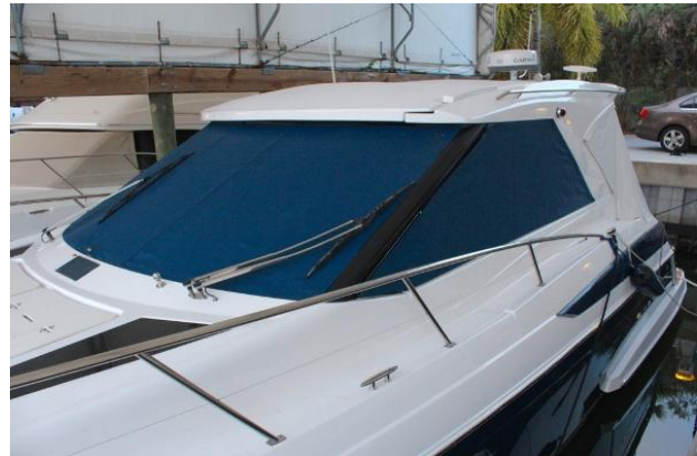
Forward Canvas Cover