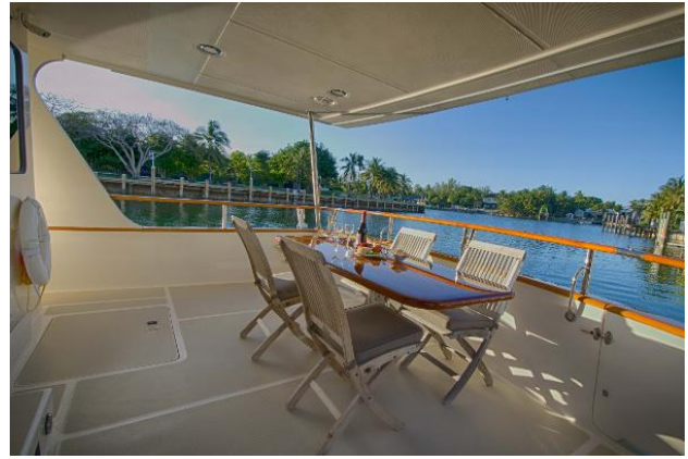
Aft Deck Seating