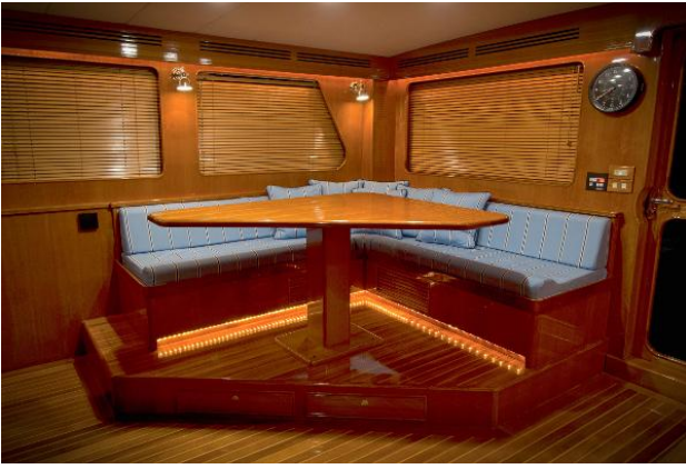
Command Bridge Dining