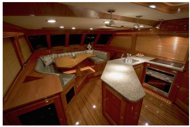
Galley & Dining