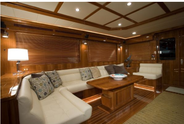
Salon Stbd Aft