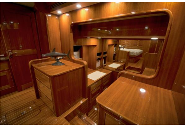
Master Stateroom Office Area