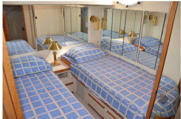
Guest Cabin Port