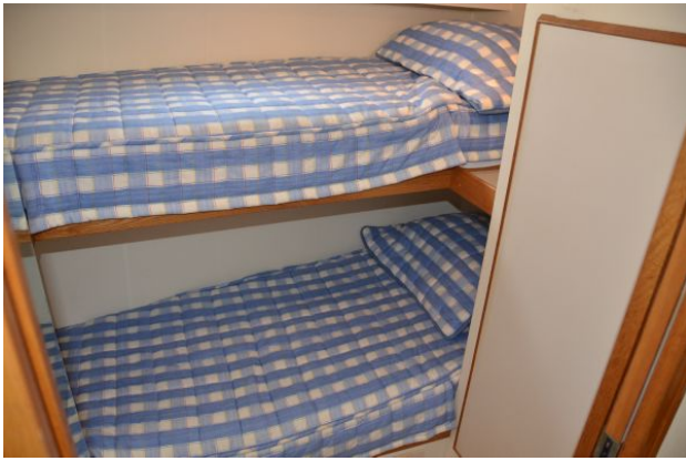
Guest Cabin Starboard