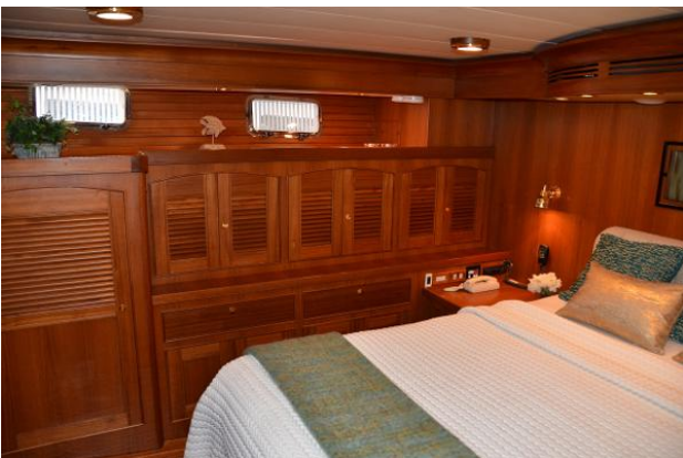
Master stateroom looking starboard