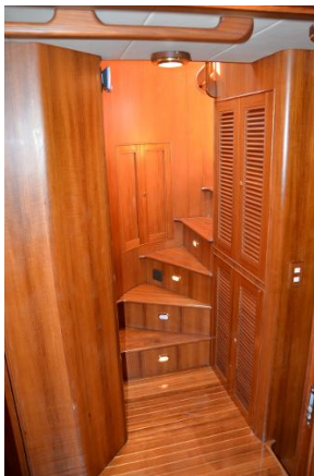
Stairs from flybridge to lower companionway