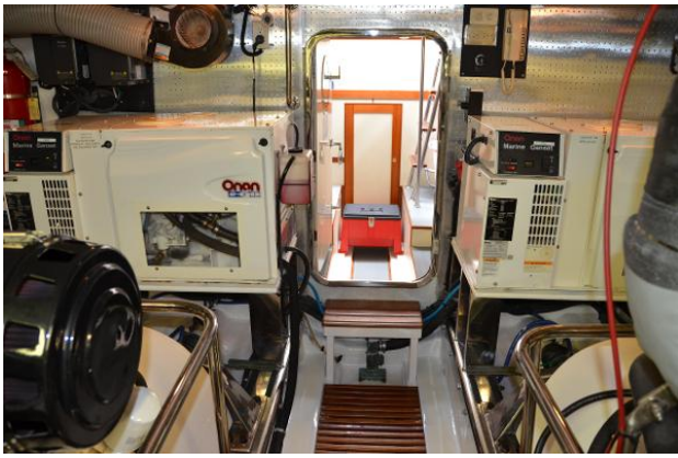
Engine room looking aft