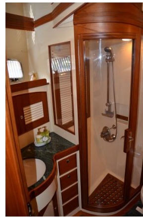
Forward VIP & guest head