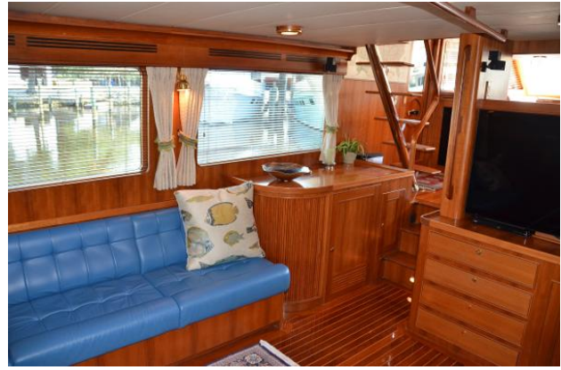
Salon bar area