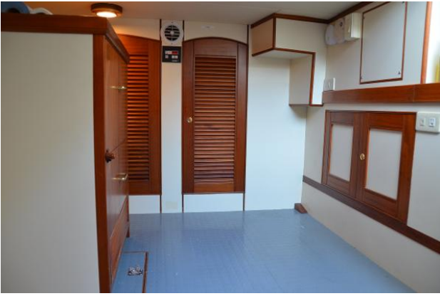
Lazarette looking starboard