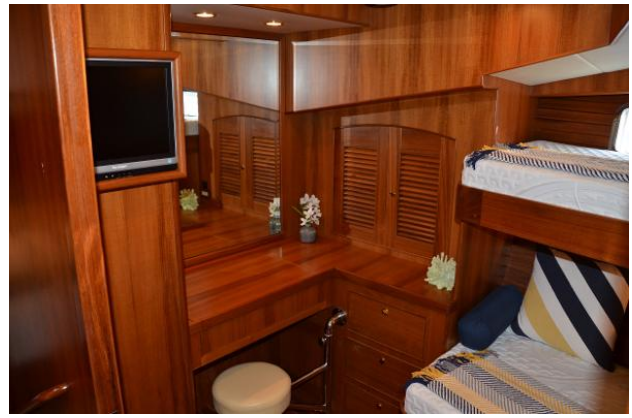
Port guest suite desk area