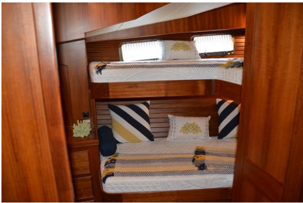
Port guest stateroom