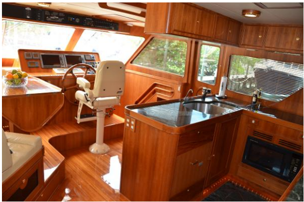
Galley and pilothouse helm