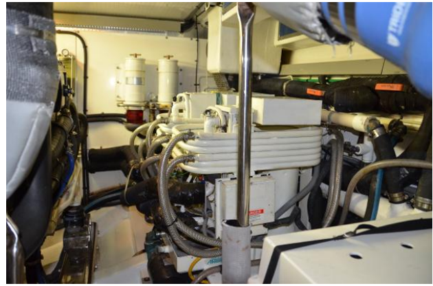
Engine room outboard starboard