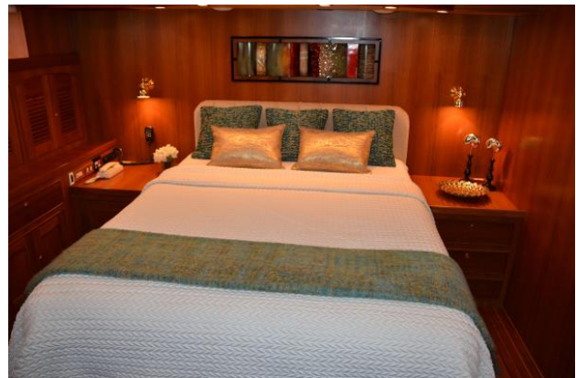
Master stateroom looking aft