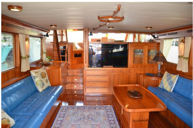
Salon looking forward