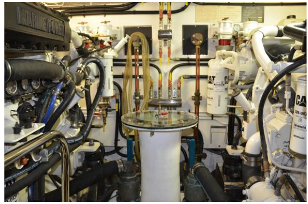
Engine room forward- sea chest