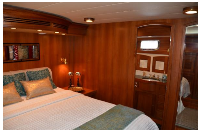
Master stateroom looking port