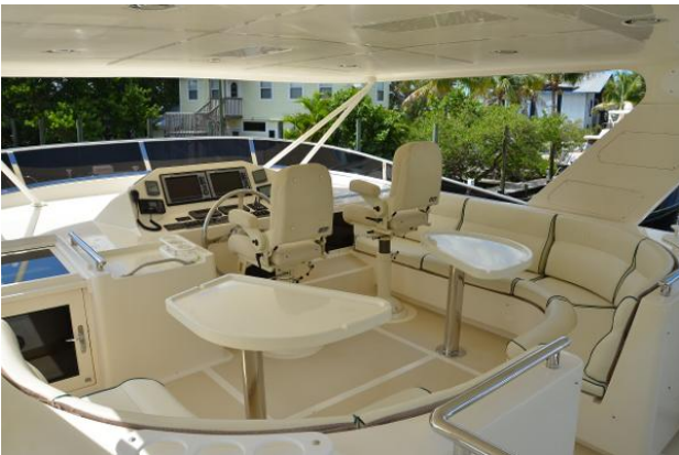
Flybridge looking starboard