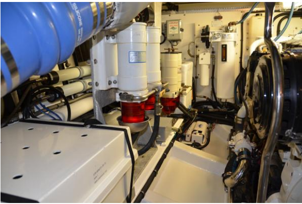
Engine room outboard port