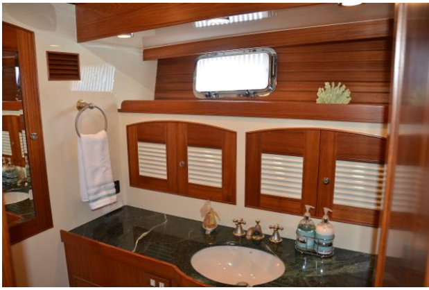
Master head sink and vanity