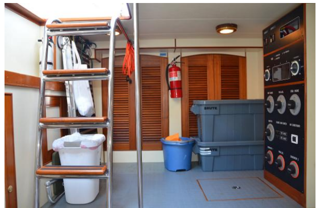
Lazarette looking port