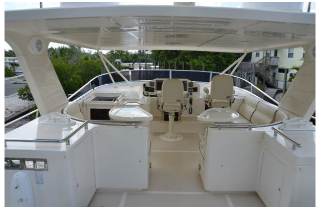
Flybridge looking forward