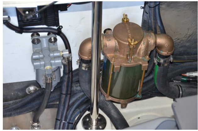
Bronze Engine Strainer