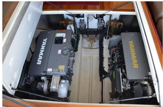
Engine Room Looking Forward