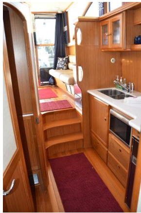
Companionway Looking Aft