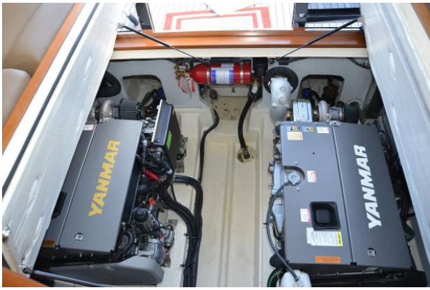
Engine Room Looking Aft