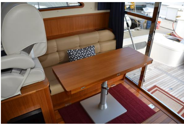
Starboard Settee & Hilow Table