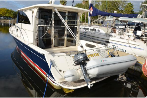
Port Aft Profile