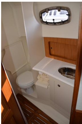
Port Master Head