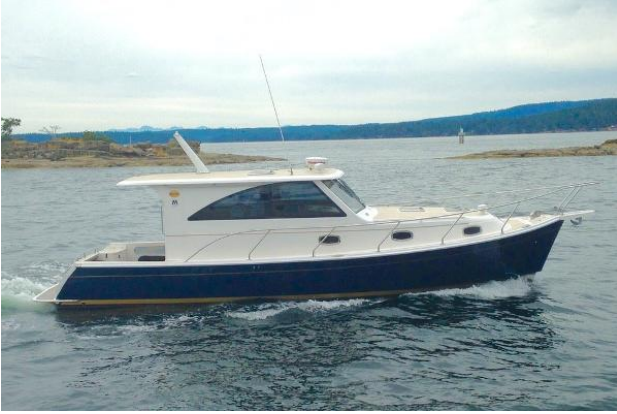
Sister Ship Profile