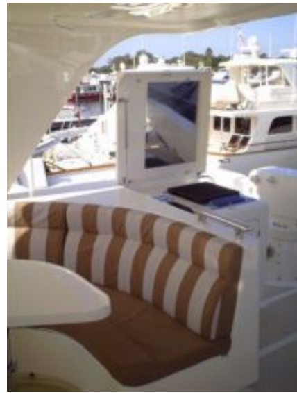
FB Seating and Bar