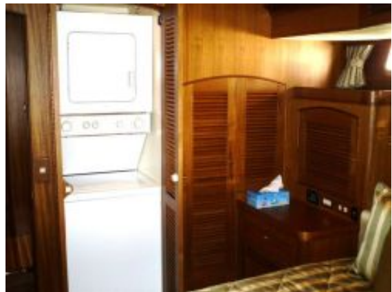
Washer Dryer in Master