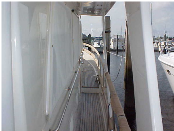
Wide Side Deck Starboard