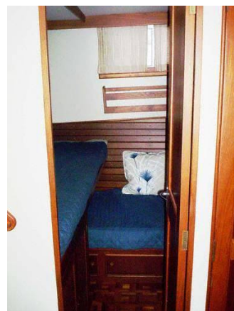
Guest State Room