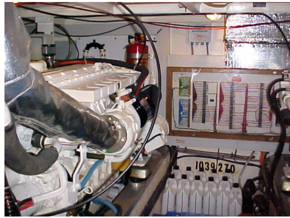
Engine Room Port