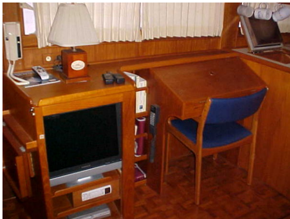
Entertainment Center & Desk