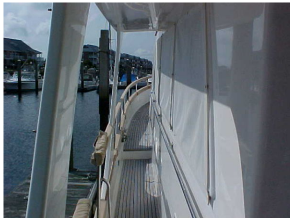
Wide Side Deck Port