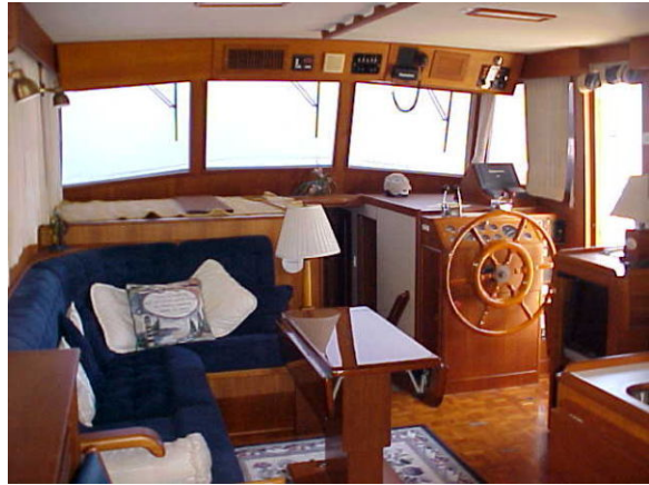
Salon & Dinette