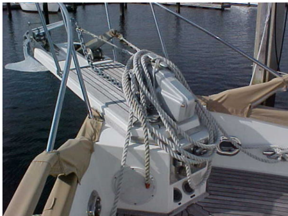
Pulpit & Windlass