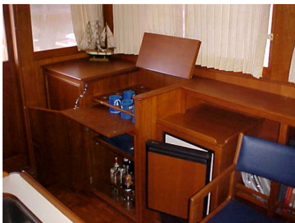
Galley Port Side