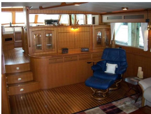
Salon fwd stbd.