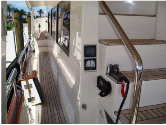
Aft Control Station