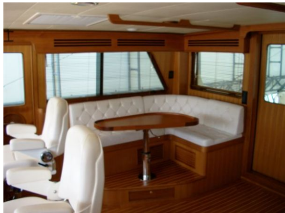
Command Bridge seating - starboard