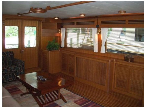
Salon aft port