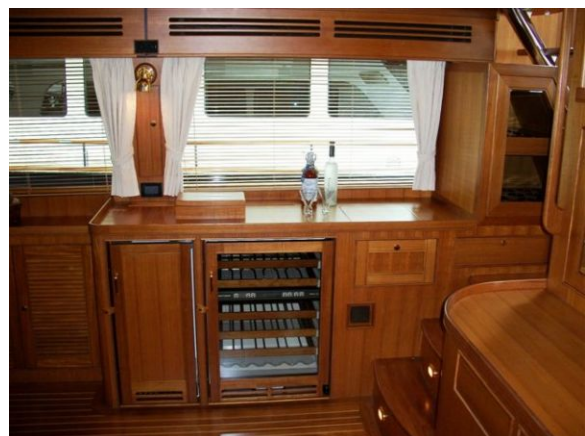
Salon bar & wine cooler