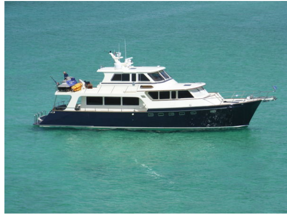
Profile at anchor