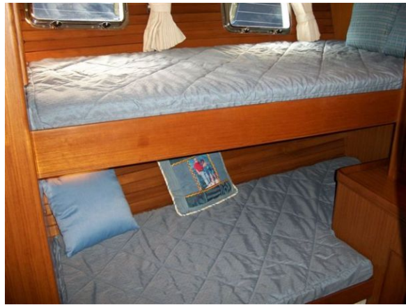
Guest cabin with over under berths