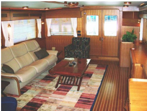
Salon aft stbd.