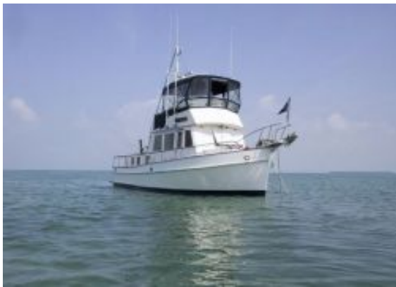
Great Idea at Anchor