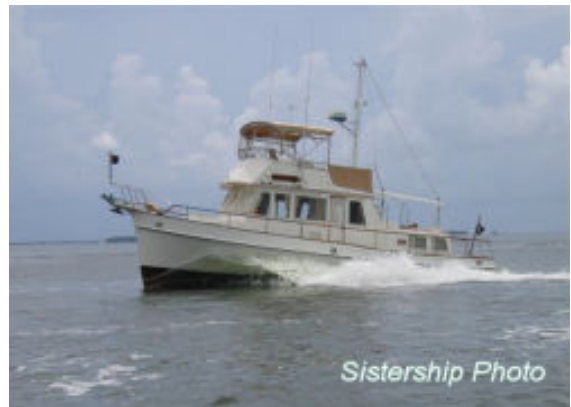
Twin 210 Cummins - 15 knots