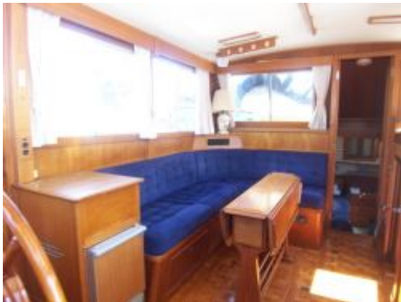
Salon Settee & Dry Bar