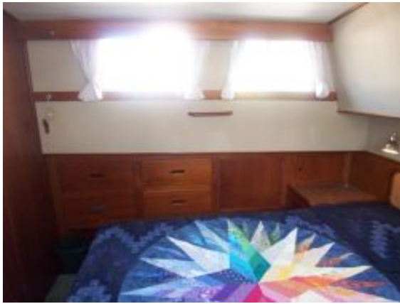
Master Stateroom Starboard