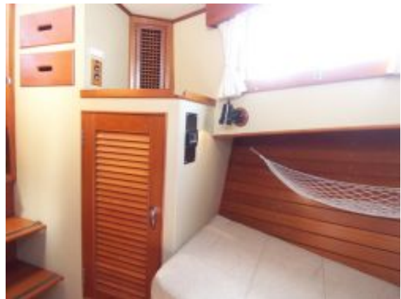
Forward Stateroom Port Side