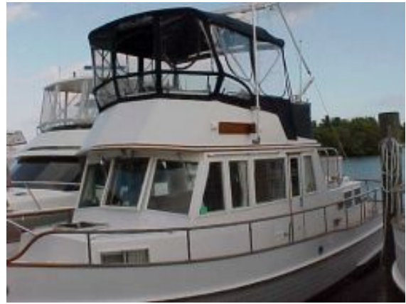
Full Canvas Enclosure