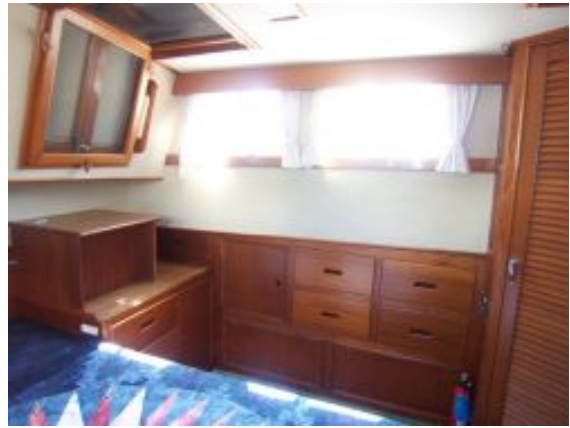
Master Stateroom Port Side