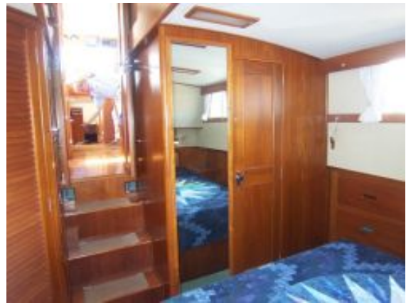
Master Stateroom Looking Forward