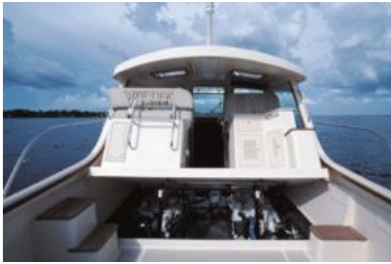
Engine Hatch Open