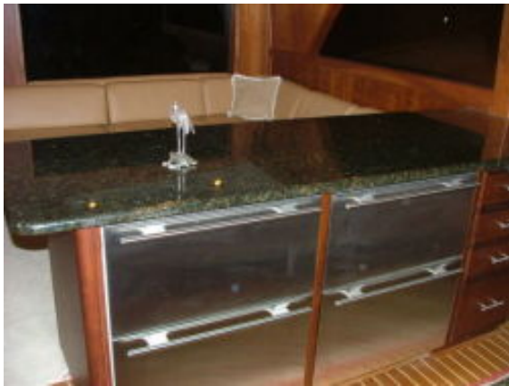
Sub Zero Ref/Freezers