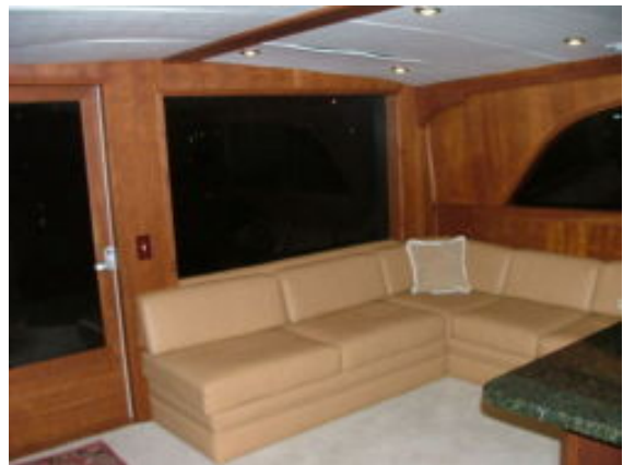
Custom Leather Sofa in Salon