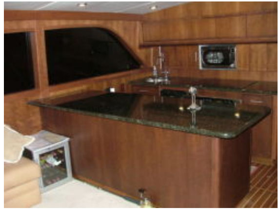
Salon Looking forward to port