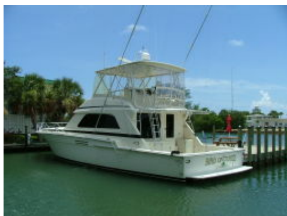
BIRD ON TURTLE