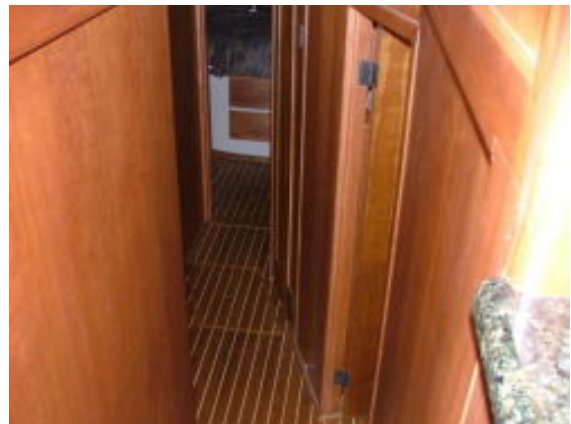
Teak and Holly floors in hallway