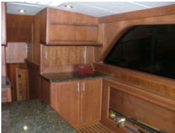
Salon Looking forward starboard