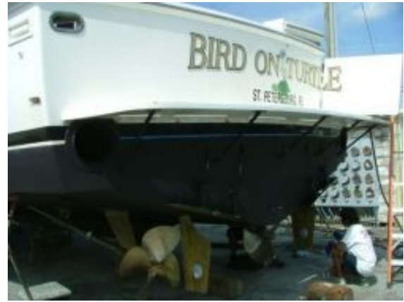
Transom while hauled