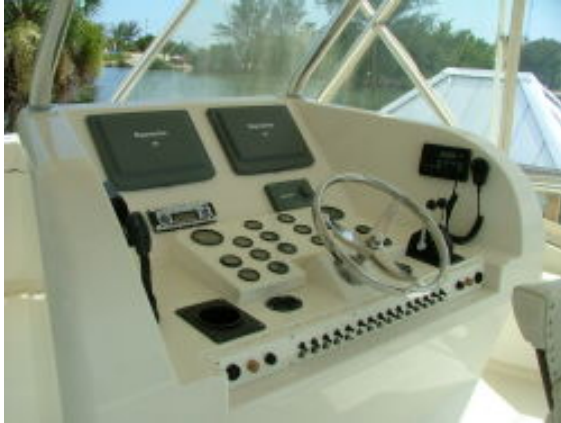
Well Laid out helm area