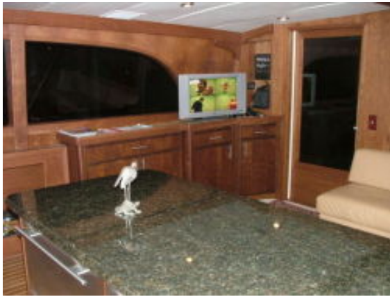
Salon Looking aft. Bird on Turtle