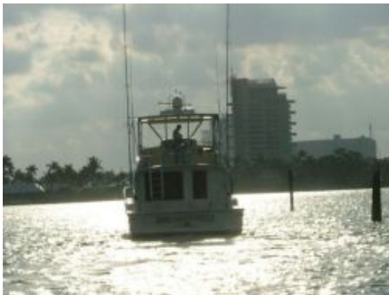
Ft.Lauderdale YC 2